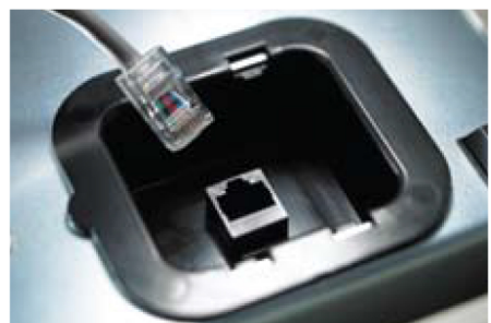
b | MultiPRO® Interface The MultiPRO interface adapts to most POS platforms.