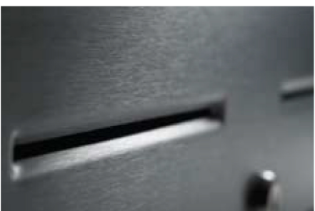
a | Beveled Media Beveled media slots flow into flexible media storage.