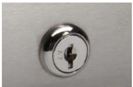
c | Four-Function Lock Proven four-function lock offers several levels of security: locked closed, locked open, online, manual open.