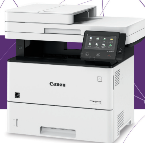
imageCLASS D1650 shown

Designed for small to mid-size workgroups, the imageCLASS D1650/D1620 balances speedy performance, minimal maintenance, and the ability to expand paper capacity for busy groups. A 5" color touchscreen delivers an intuitive user experience and can be customized by a device administrator to simplify many daily tasks. A legal-sized platen glass accommodates diverse scanning and copying needs.