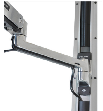
RECOMMENDED: ATTACH WALL MOUNT ARM TO AN ERGOTRON WALL TRACK USING BRACKET (97-091)