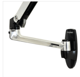
LX EXTENSION INCREASES REACH BY 9" (23 CM) WHITE (45-289-216) POLISHED ALUMINUM (45-289-026) MATTE BLACK (45-289-224)