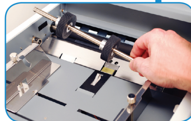
Removable Feed Wheels