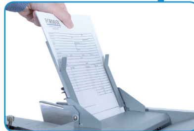
Optional Multi-Sheet Feeder