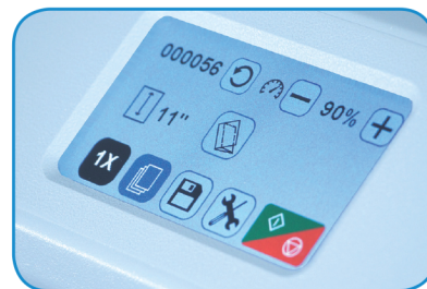
Large color touchscreen

AutoBatch™: Programmable to process pre-set number of sheets into sets with a delay