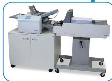
FD 386 in-line with optional V-Stack36i Vertical Stacker, multi-sheet feeder, stand and cabinet