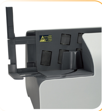
Easy-to-use support arm extends to hold large envelopes