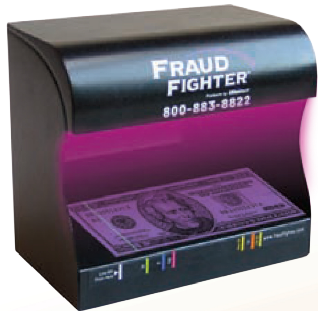
With Fraud Fighter™ Verification