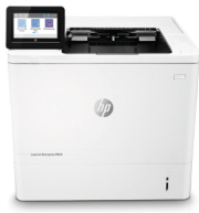
HP LaserJet Enterprise M610dn

Dynamic security enabled printer. Only intended to be used with cartridges using an HP original chip. Cartridges using a non-HP chip may not work, and those that work today may not work in the future. http://www.hp.com/go/learnaboutsupplies