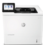
HP LaserJet Enterprise M610dn