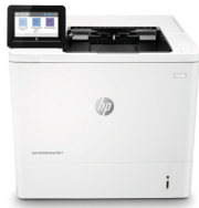
HP LaserJet Enterprise M611dn

Dynamic security enabled printer. Only intended to be used with cartridges using an HP original chip. Cartridges using a non-HP chip may not work, and those that work today may not work in the future. http://www.hp.com/go/learnaboutsplies