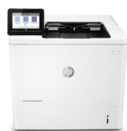
HP LaserJet Enterprise M611dn