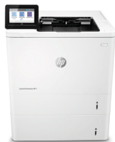
HP LaserJet Enterprise M611x