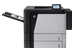
HP LaserJet Enterprise M806dn Printer