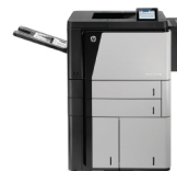
HP LaserJet Enterprise M806x+ Printer