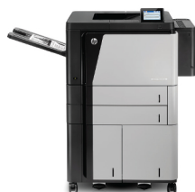
HP LaserJet Enterprise M806x+ Printer