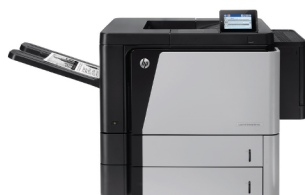
HP LaserJet Enterprise M806dn Printer

This HP LaserJet handles big print jobs fast, with extra-large input capacity and versatile paper-handling options. Mobile printing is simple with wireless direct printing and touch-to-print technology. Easy upgrades protect your investment. 1,2