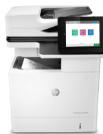
HP LaserJet Enterprise MFP M635h