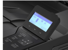
A tilting 4-line LCD panel graphically displays supply levels and system status.

The P 501M supports PCL 5e, PCL 6 and PostScript3 emulation with simple point-and-click drivers and dozens of fonts for creative printing in many styles onto media up to 8.5" x 14". Print up to 999 sets per job at 45-ppm and feed envelopes and labels from every source. The Bypass Tray extends media length up to 35.4" for banner and signage printing. Place watermarks on pages and add covers, slip sheets and chapters to create more professional-looking documents. Install the optional 320 GB hard disk drive to take advantage of a cluster of printing modes designed to enhance productivity and confidentiality, and securely store up to 9,000 pages of data for print-on-demand.