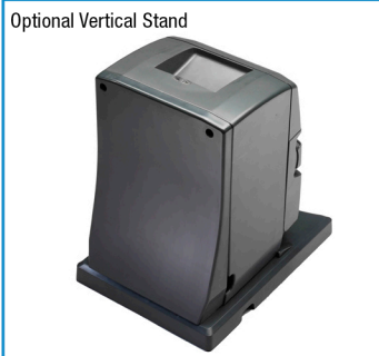
Optional Vertical Stand