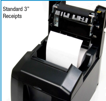
Standard 3" Receipts