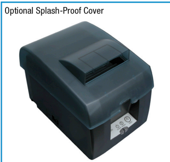
Optional Splash-Proof Cover