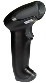
Fig. 1: Voyager 1250g Scanner

Building on the legacy of the world-renowned Voyager™ series of scanners, Honeywell's Voyager 1250g single-line laser scanner provides a superior out-of-box experience and aggressive reading of linear bar codes, including larger bar codes up to 23 inches away.