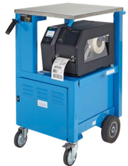
Powered Mobile PrintCart