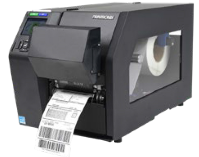
Barcode Verifier (T8000 ODV-2D)